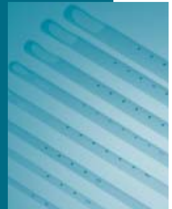
lpas flexible cannulae used with MVA.

failed abortions that were performed by either surgical or medical (pharmacological) methods. The method has the capacity to dramatically expand women's access to abortion services. In remote areas, MVA may be the difference between safe and effective abortion services and no services at all. MVA can be "extremely effective in improving the accessibility of high-quality abortion services at all levels of the health system...MVA can play a very important role in helping providers offer safe, effective abortion care that is acceptable to women and responds to their needs—that is, care that can truly make a difference in improving women's health" (Greenslade et al., 1993a).